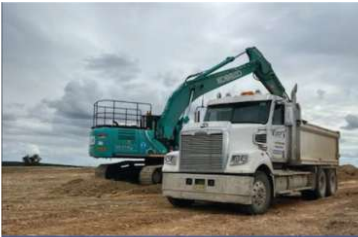
BIG AND SMALL JOBS