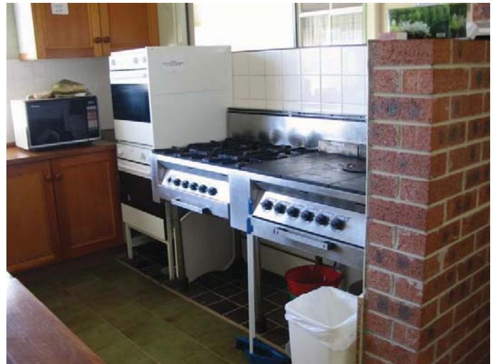
The new stove at the progress hall from Ross and Joy Sutcliffe. The old stove has been sent to Nerriga Progress.