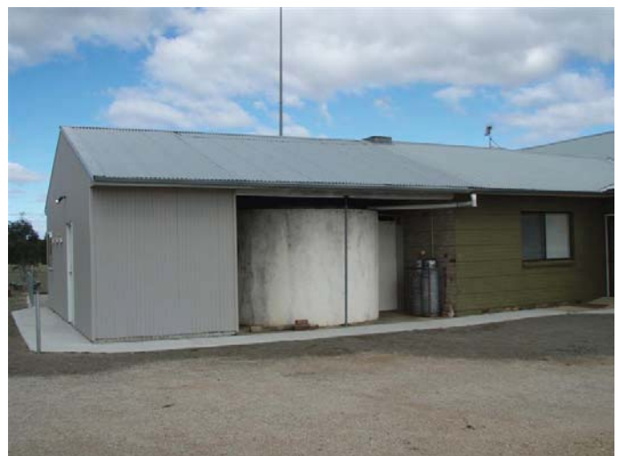
New roof at the hall