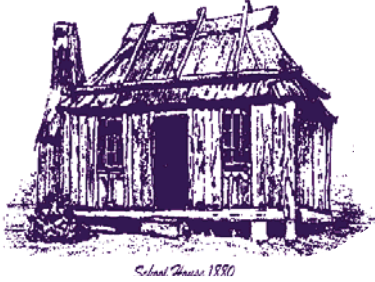
School House 1880

Windellama Progress Association Hall Inc. Vol. 13 no. 9 – October 2009