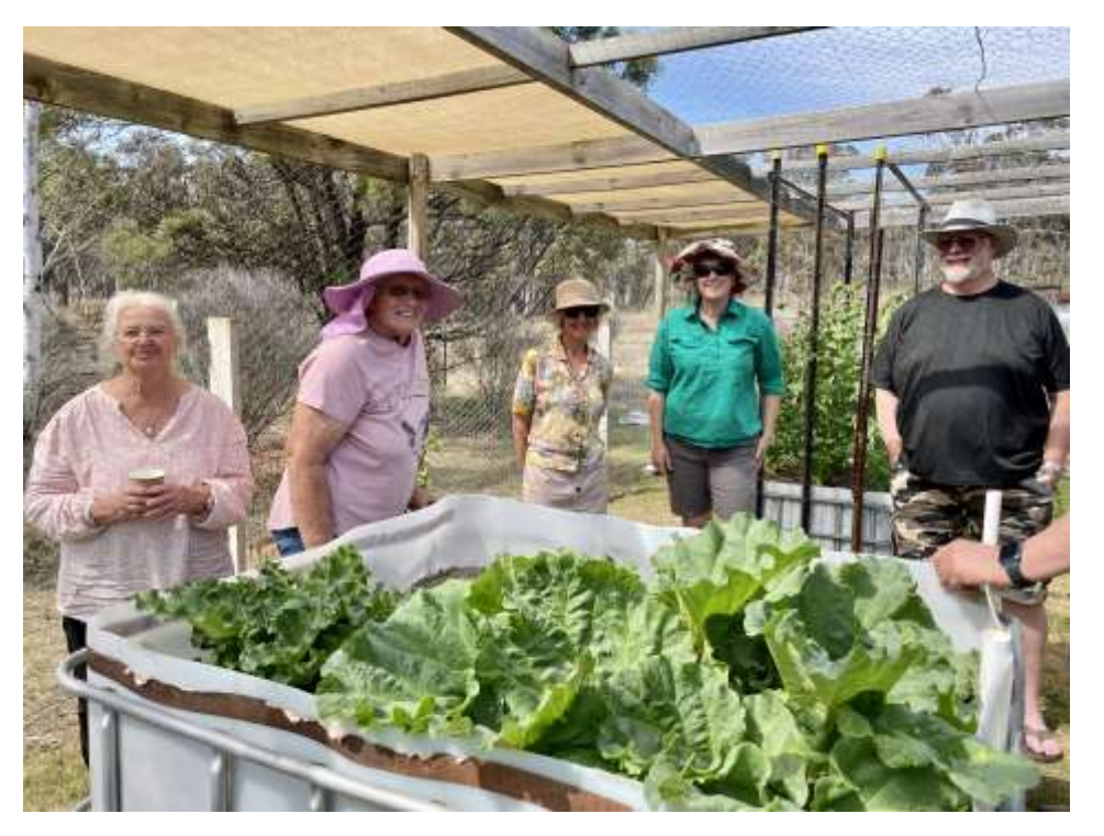
(Continued on page 23)