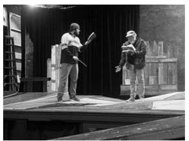
Based on the novel by Kate Grenville and adapted for the stage by Andrew Bovell, The Se-cret River tells the story of convict William Thornhill, exiled from the stinking slums of early 19th century London, who discovers that the penal colony in Australia offers something that he never dared to hope for before: a place of his own. A stretch of land on the Hawkesbury River is Thornhill's for the taking. As he and his family seek to establish themselves in this unfamiliar territory, they find that they are not the only ones to