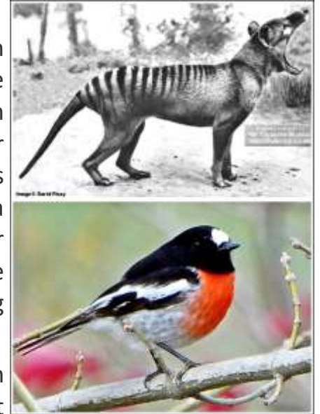
Top: 'Benjamin'. Source: Thylacine Museum. Photo by Dr. David Fleay – 1933

Australia has the worst animal extinction record in the world – 54 Australian mammals, birds, frogs and other animals have become extinct since European settlement. 35% of all modern global mammal extinctions have been Australian mammal species (30 out of 84 worldwide extinctions). No other country or continent has such a tragic record. The Australian Environment Protection and Biodiversity Conservation Act currently lists 54 Australian animal species as critically endangered. All species on this list are at a very high risk of becoming extinct in the near future, sadly some species on the list in all likelihood are already extinct.