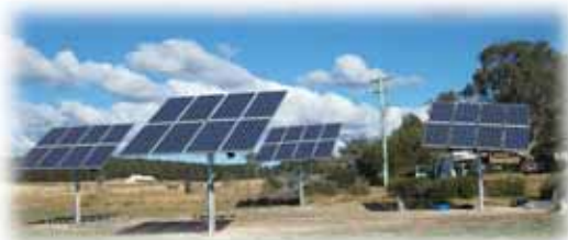
5KW Grid Connect - Oallen Ford