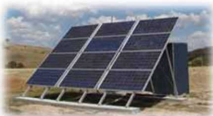
2KW Stand Alone - Tarago