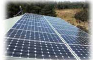
3KW Grid Connect - Bungendore