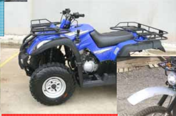
quad bikes 250cc $5000