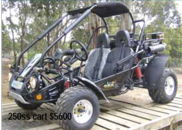
250ss cart $5600

Carts & buggies from $3300 great farm vehicle $150cc $3300 250cc $5600