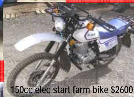
150cc elec start farm bike $2600