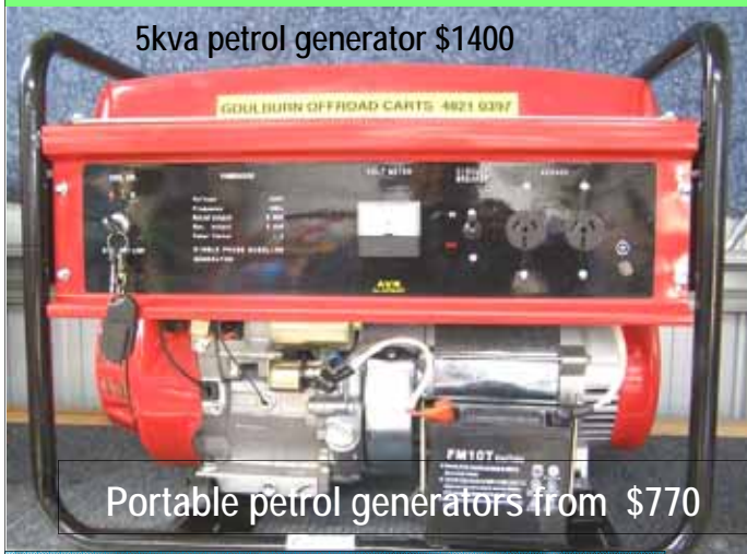
5kva petrol generator $1400