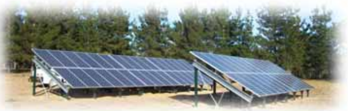
10KW Grid Connect - Tarago