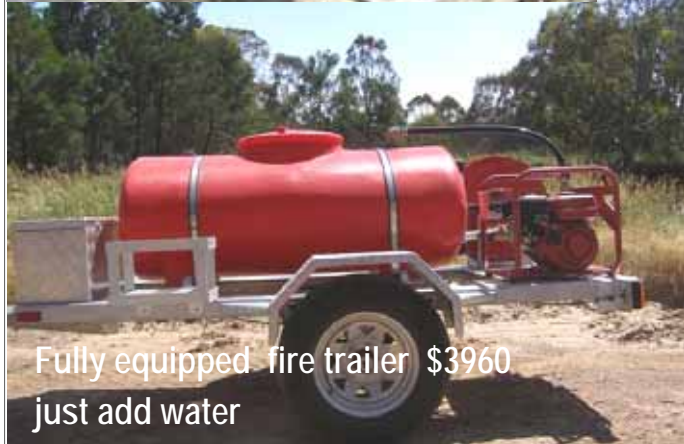
Fully equipped fire trailer $3960 just add water