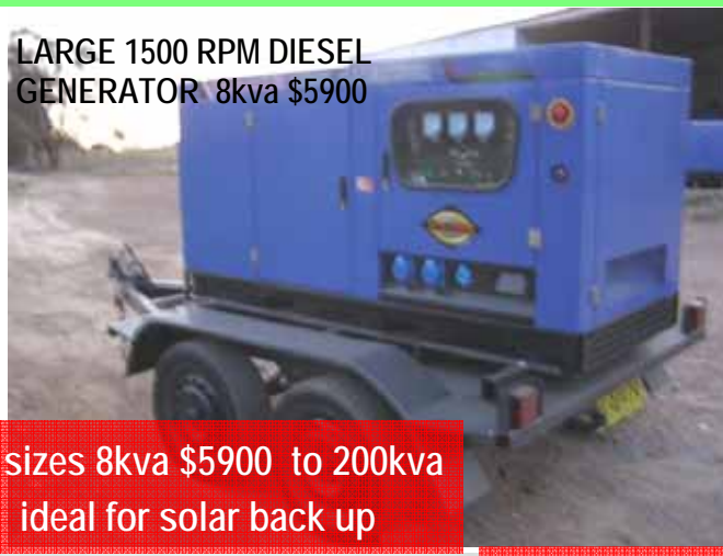
LARGE 1500 RPM DIESEL GENERATOR 8kva $5900