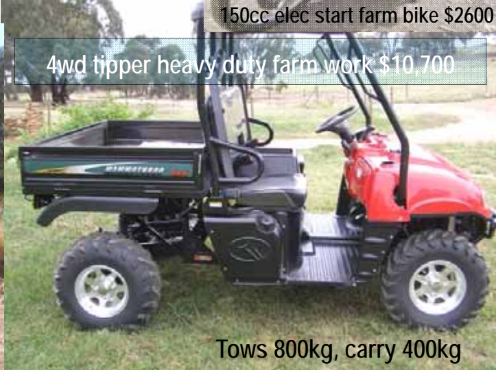
4wd tipper heavy duty farm work $10,700