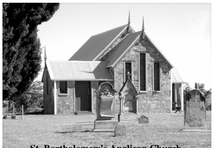
St. Bartholomew's Anglican Church

Although both our Churches are nominally Anglican, worshippers of all denominations are welcome at all services.