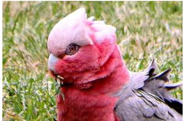
A galah on our lawn - feeding the way nature intended

The best way to encourage birds to your garden is by providing plenty of native shrubs and other vegetation where they can not only find their own food, but also shelter, nest and hide from predators. A birdbath will also encourage birds to visit you, and will provide an essential and reliable source of water for them. Birdbaths should be scrubbed clean and refilled daily to avoid the spread of disease such as the PBFD mentioned above, and also should be topped up through the day in times of excessive heat.