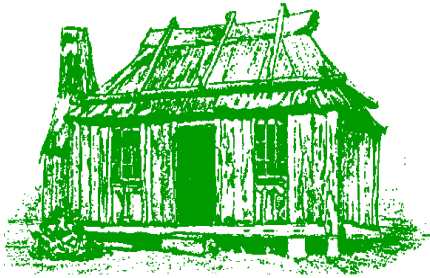
School House 1880