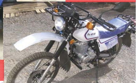
150cc elec start farm bike $2600