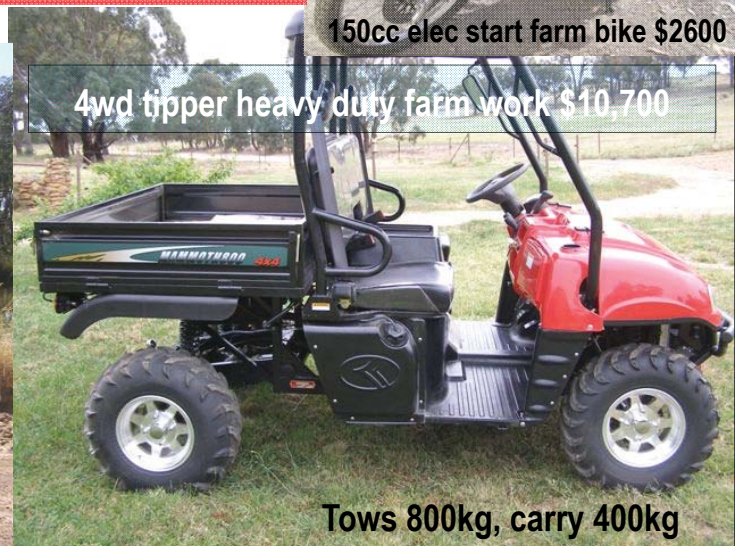
Tows 800kg, carry 400kg