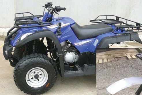
quad bikes 250cc $5000