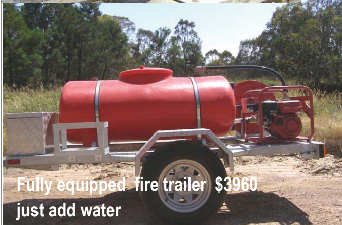
Fully equipped fire trailer $3960 just add water