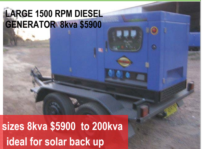
LARGE 1500 RPM DIESEL GENERATOR 8kva $5900

All sizes 8kva $5900 to 200kva ideal for solar back up