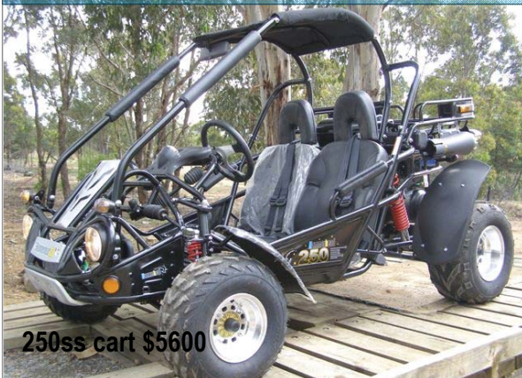
250ss cart $5600

Carts & buggies from $3300 ,great farm vehicle $150cc $3300 250cc $5600