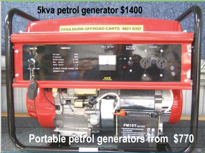
5kva petrol generator $1400