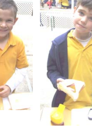
The children made Heart shaped sandwiches with honey or jam (some had both!) for the letter 'H'.