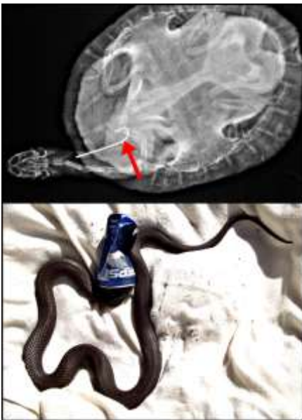
Top: X-ray of Eastern long-necked turtle - arrow showing swallowed fishing hook.

We all use bottles with a plastic seal around the top - how we dispose of this small ring can be the difference between life and tragic death for unwitting wildlife. Before disposal, cut it open so it no longer poses a threat.