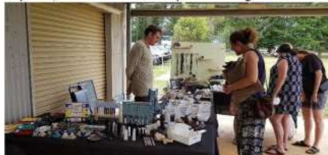
Crystals, oils and resin art by Justin Magnee