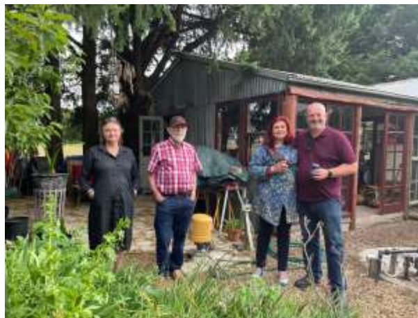
Admiring the veggies.

COVID-19 has made it a challenging year for all of us (again), but through it all we were able to continue with our gardening efforts and gain inspiration from each other. Let's hope 2022 will be another success story for all of our members, both in and out of the garden.