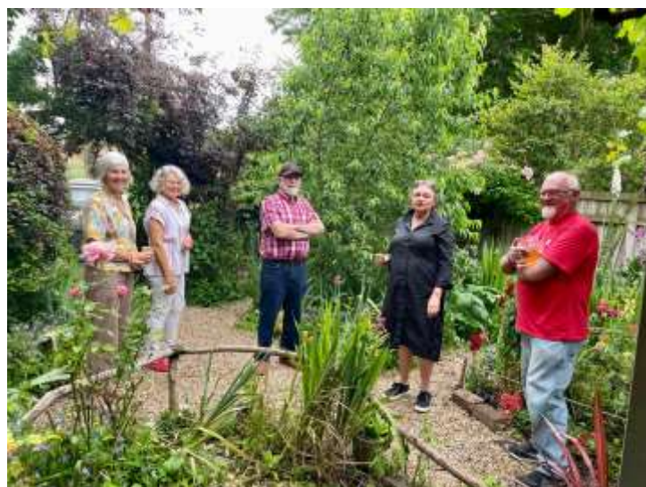
Enjoy some Christmas cheer in the garden.

Not surprisingly, the snails were out in full force, munching away at any and everything they can find in the garden. It's a pity that they don't focus on weeds and not the crops; then they would be more welcome! Some members suggested beer traps and coffee grounds sprinkled around the base of plants as useful remedies for the snail and slug problem. These can be an alternative to snail pellets which can poison lizards and birds if they pick them up.