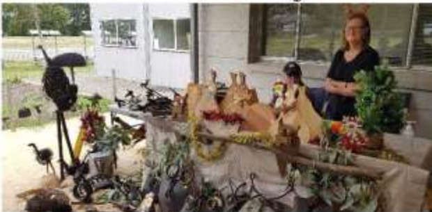
Bev Woodham and their fabulous garden art