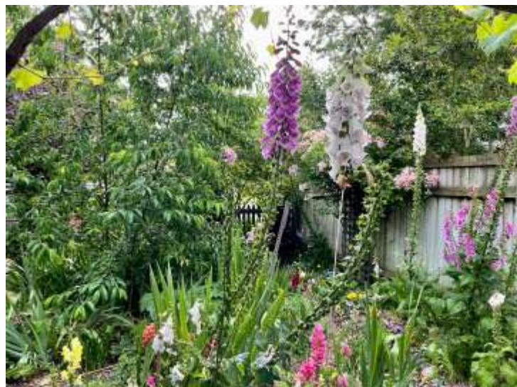
The garden blooms.

The cool temperatures and overcast conditions that we have been experiencing have slowed the ripening of many fruit and vegetables, as they are clearly missing the usual summer heat, but we all agreed that the current conditions are better than heatwaves and drought. Just like farmers, I guess we are never satisfied with what the weather serves up.