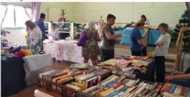
Plenty of customers too