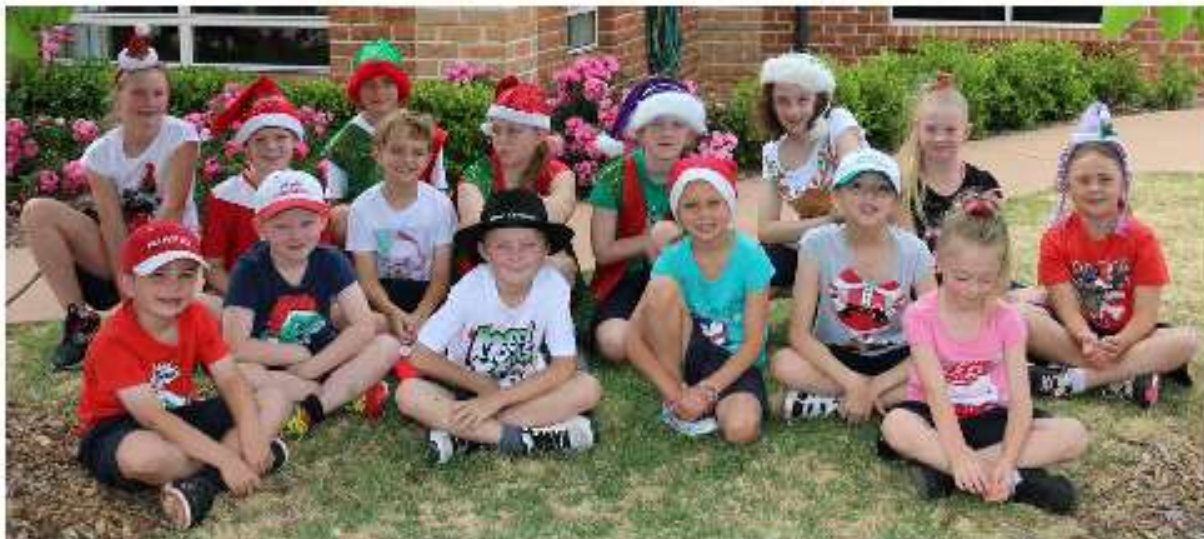
Students relaxing before their BIG performance!