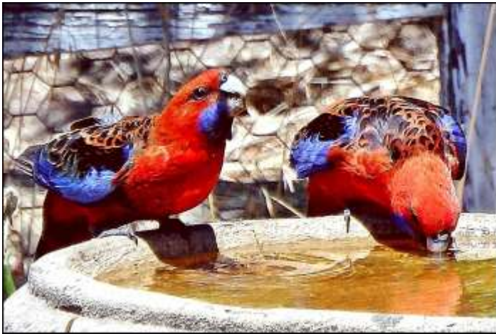
Crimson Rosellas enjoying a drink at our birdbath

Therefore birdbaths are very important, and ideally there should be at least one in every garden. Raised or pedestal type birdbaths situated by shrubs or small trees are best for our smaller birds, as this gives them some protection from predators – they can make a quick dash back into the safety of the vegetation if danger threatens.