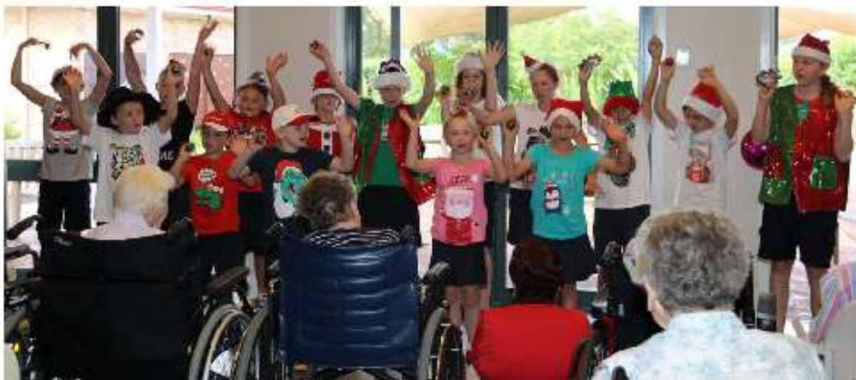
Students enjoy spreading Christmas cheer to the residents at Waminda.