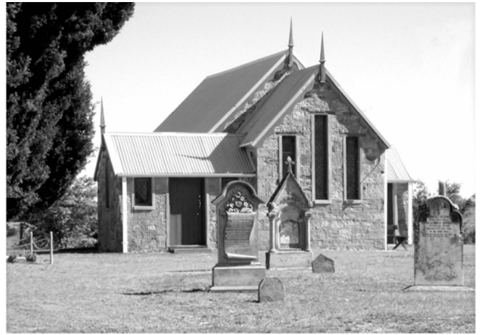
St. Bartholomew's Anglican Church