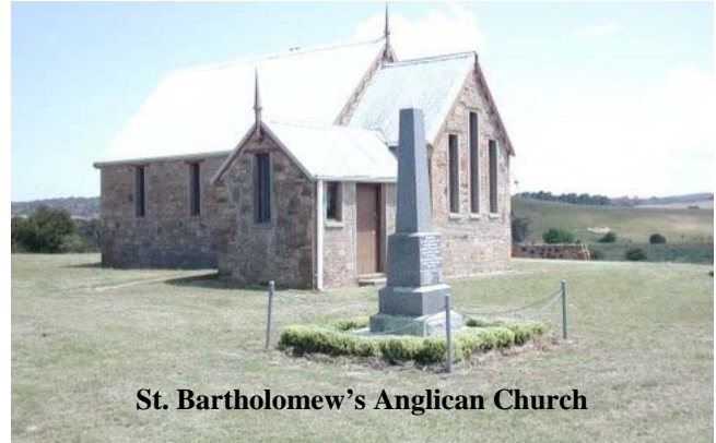
St. Bartholomew's Anglican Church

10th December 10.30am Mass 24th December 10.30am Holy Communion