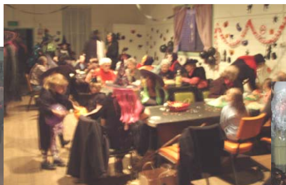
Monster Celebration snapshots