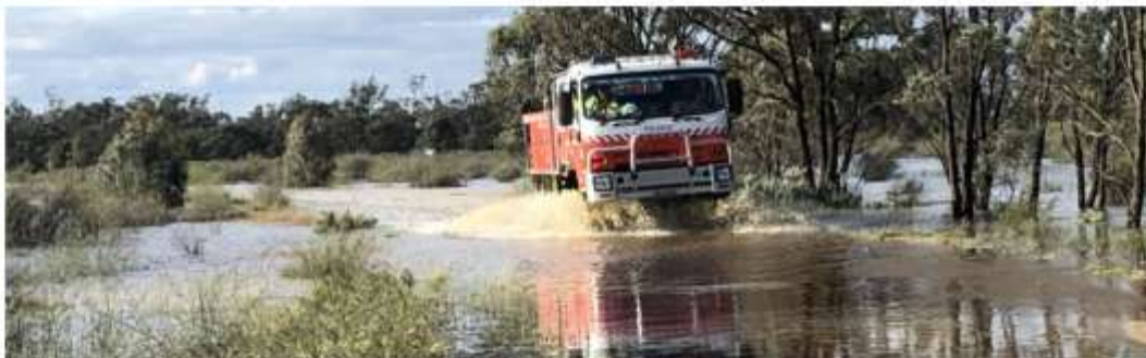
RFS undertaking welfare checks and delivering supplies to flood stranded properties in 2023.

Flood rescue capability for Windellama RFS. In implementing one of the recommendations of the NSW Government's Flood Inquiry following the flood disaster response in 2021/22, all five Windellama RFS vehicles have been equipped with flood rescue kits. Our members have had online training and several practical training sessions in flood rescue.